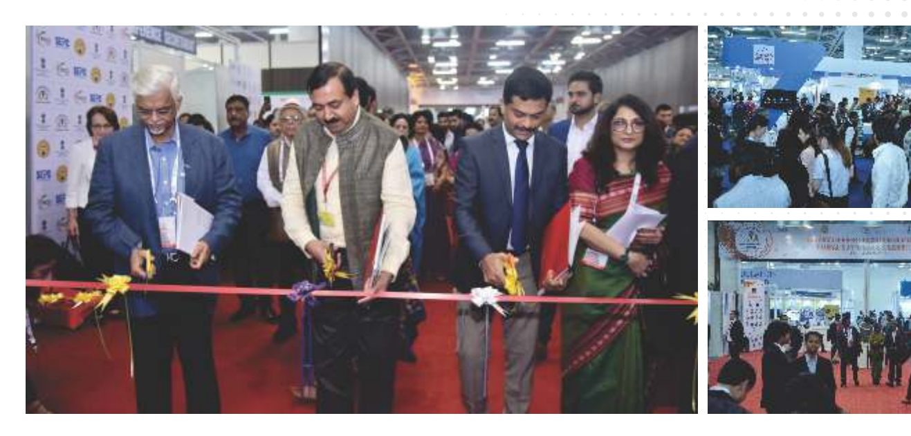
The 3 days exhibition witnessed overwhelming support and participation from leading institutions from across the globe.